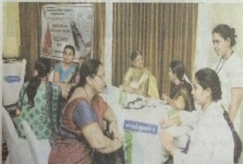
A free medical camp was organised as part of the World of Women event.